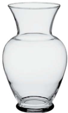
4042-06-09 10 5/8 " Classic Urn